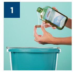
Add 2 capfuls of MelaMagic to 1 gallon of water.