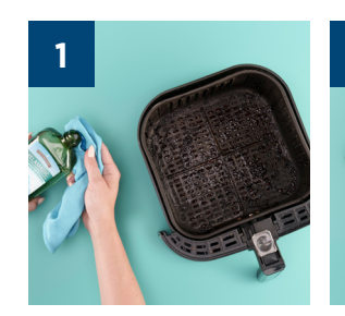
Apply full strength and let sit for 5-10 minutes.