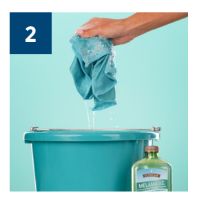
Apply with mop, cloth, or sponge.